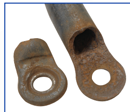
FAILED OE SWAY BAR

The ends of hollow design sway bars are welded. These welds can rust and fail, causing the end of the bar to split at the weld and break.