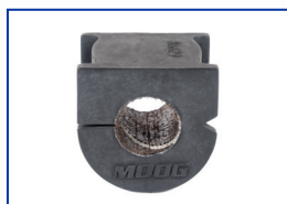
SYNTHETIC FABRIC LINED BUSHINGS INCLUDED WHERE APPLICABLE