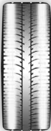
Inner/Outer Edge Wear

Camber that is out of specification will cause the vehicle to pull left or right and will create wear on the inside or outside edge of the tire.