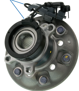
MOOG HUB ASSEMBLY (P/N 515110 SHOWN)

For applications that require it, MOOG hub assemblies include a sensor ring and harness connector.