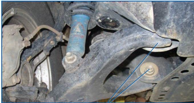
SEIZING OCCURS IN THESE AREAS, CAUSING ISSUES AND PREVENTING ALIGNMENT.

The camber adjustment bolt on lower control arms of certain Toyota trucks is subject to excessive corrosion (especially in the North, where salt is prevalent). The corrosion seizes the bolt and/or sleeve in the bushing, preventing rotation. The seized parts prevent the vehicle from being aligned properly. The process of removing the seized bolt can be difficult and may damage the bushing.