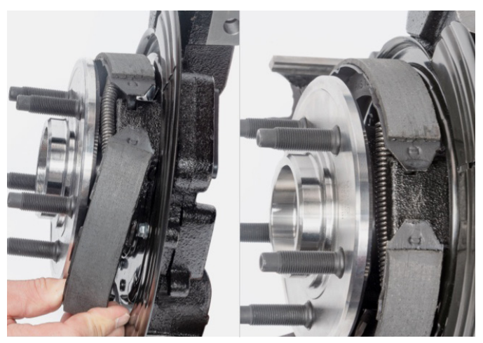
During Shoe Installation.

Step 3 – Using the front shoe and the parking brake boss' leverage, rotate the front shoe onto the knuckle.